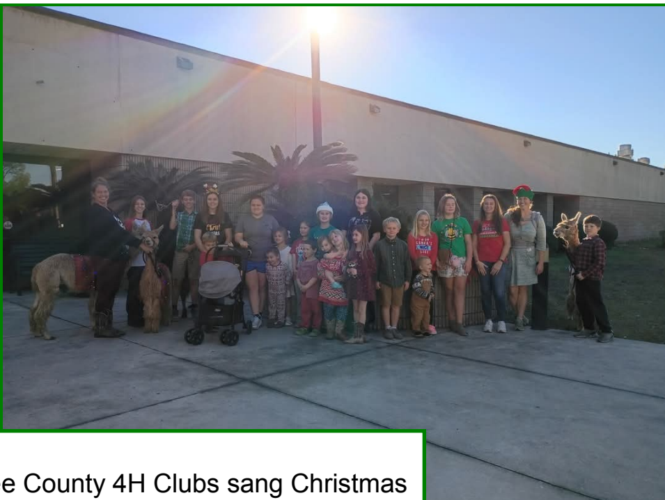
Suwannee County 4H Clubs sang Christmas carols and visited with residents at a local nursing home and rehab.