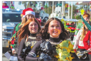
The Citrus High Hurricanes' cheerleaders march through downtown Inverness during the annual Christmas Parade.