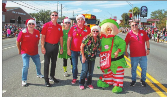
The Citrus County School Board is well represented during the annual Christmas Parade.