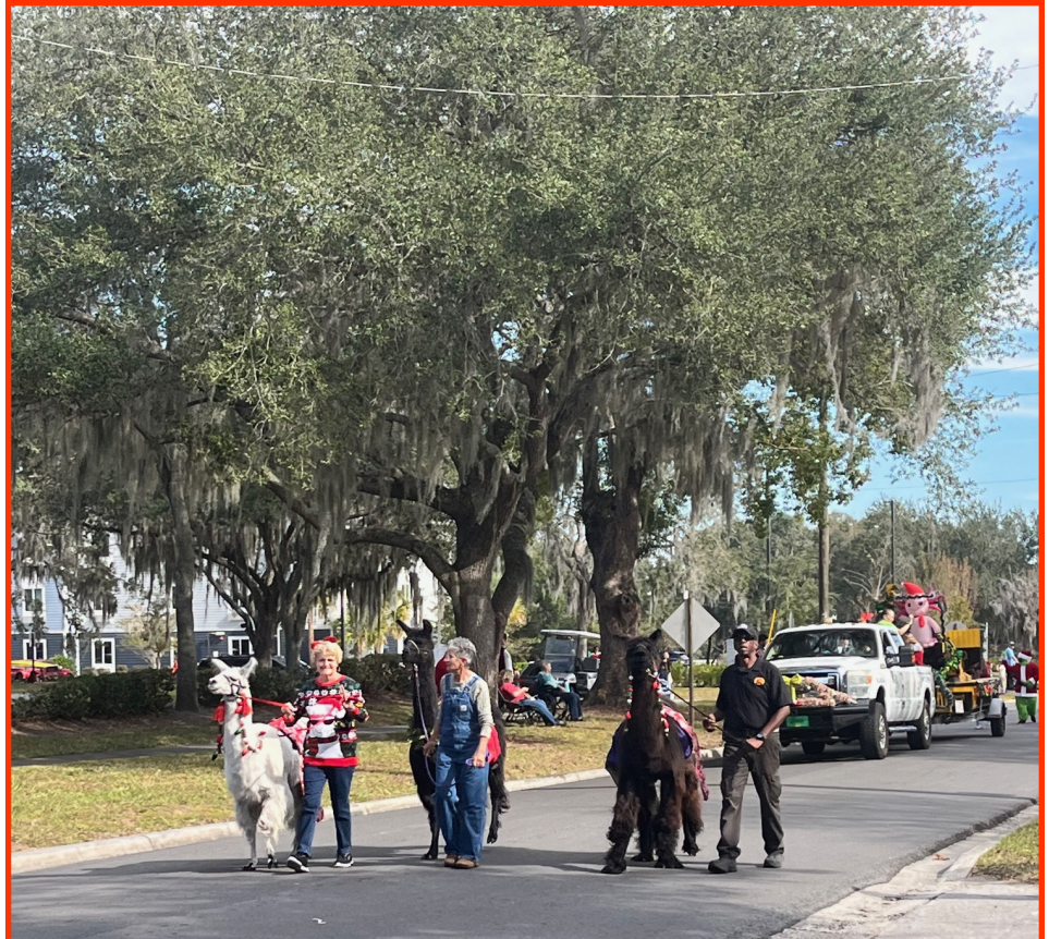
Inverness Christmas Parade